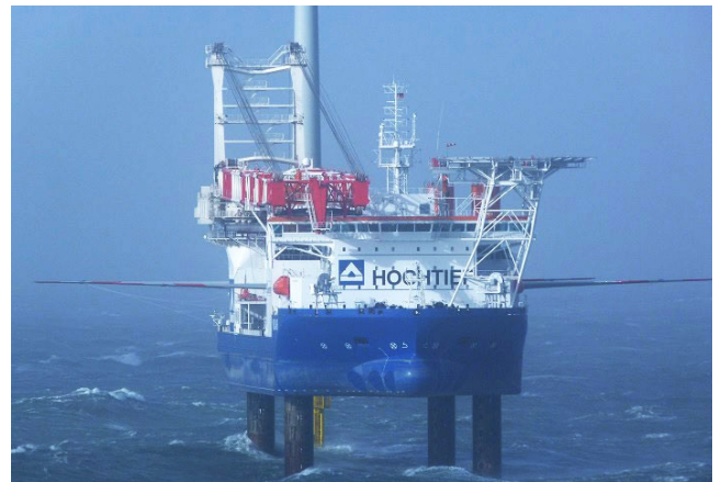
Figure 2. Jack-up ship project by StoGda

“StoGda carries out projects in every field of shipbuilding at every possible stage, from conceptual design to workshop design,” said Paweł Stadler, StoGda's Engineer.