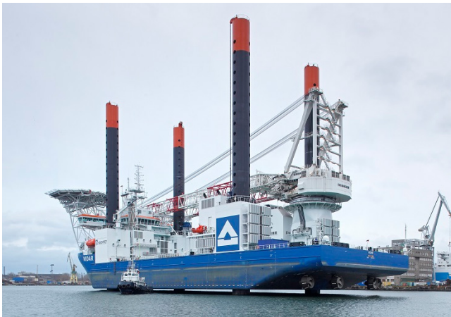
Figure 1. Jack-up ship project by StoGda

Established in 1997, StoGda Ship Design & Engineering is a ship design and engineering company from Poland. The projects they carried out include ships, other floating objects, offshore structures, shipboard systems, land-based systems, steel structures and other industrial structures. StoGda, a team of over 60 well-experienced designers, has actively engaged in the industry for the last 25 years.